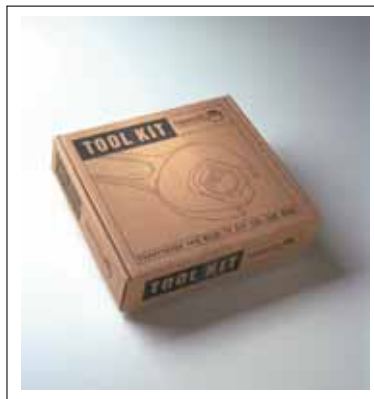
Haworth Ten dealers received this sturdy tool kit — chock full of product information, pricing, a sales video, competitive product profiles and marketing support materials. Everything they need to get the job done — with the right attitude.