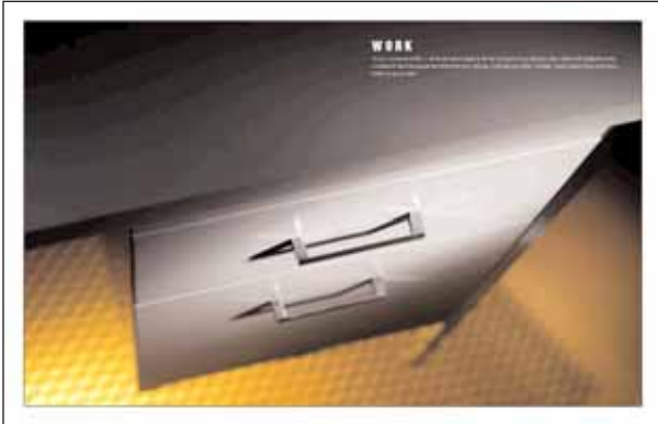
Each section of the Haworth Ten catalog – WORK desks/casegoods, SIT seating, STORE files/storage and MEET tables – is introduced with brand-reinforcing copy and imagery that's unique among mid-market competitors.